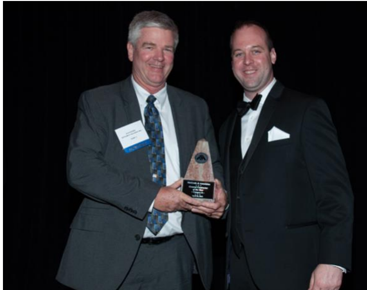
McGrath & Associates Category B