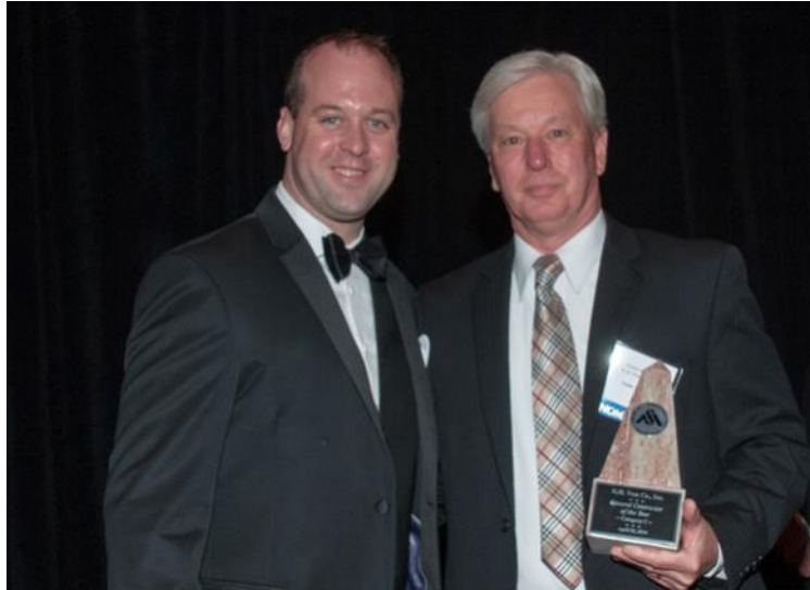
G.H. Voss Co., Inc. Category C