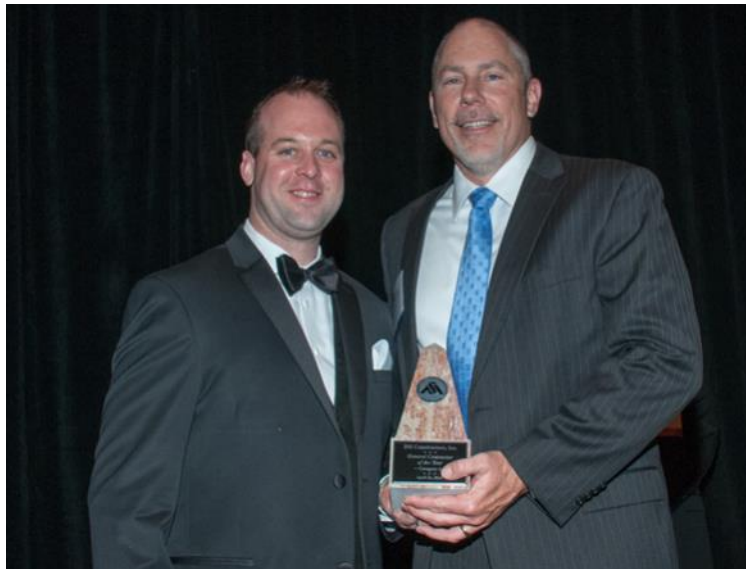
BSI Constructors Category A

To view all ASA Roaring 20's Award Gala Photos visit www.asamidwest.com