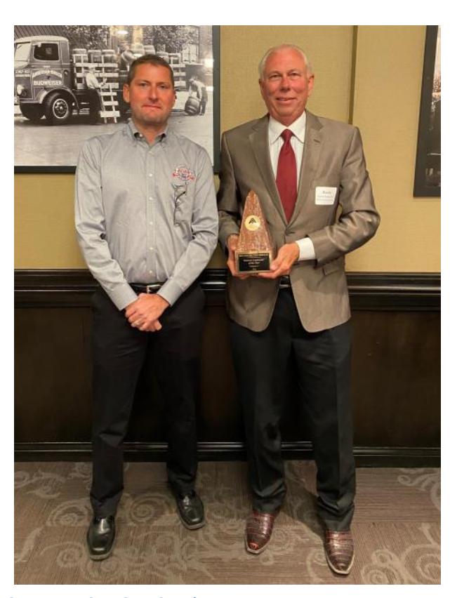
BEX Construction Services | GC OF THE YEAR CATEGORY C