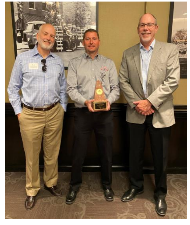
BSI Constructors | GC OF THE YEAR CATEGORY A

Due to COVID-19 the ASA Awards Gala was moved to a virtual event on July 29th. On August 19th we were finally able to distribute awards to some of our winners at our first in person meeting since the beginning of the COVID crisis!